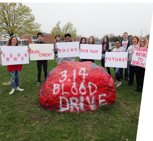
Dual Credit Day