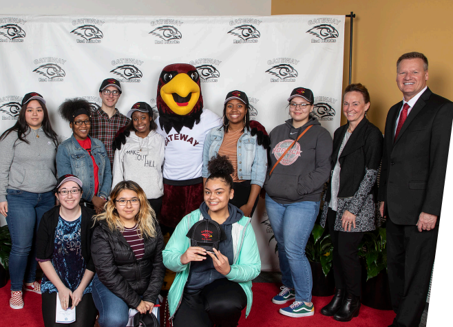
National Signing Day