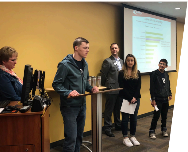
Youth Apprenticeship Celebration

263 high school students successfully completed Gateway's Nursing Assistant technical diploma. The College Access team celebrated these students on May 2 in Elkhorn and June 10 in Kenosha.