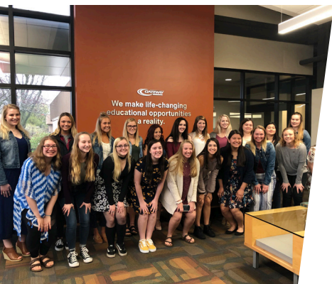
Nursing Assistant Completion