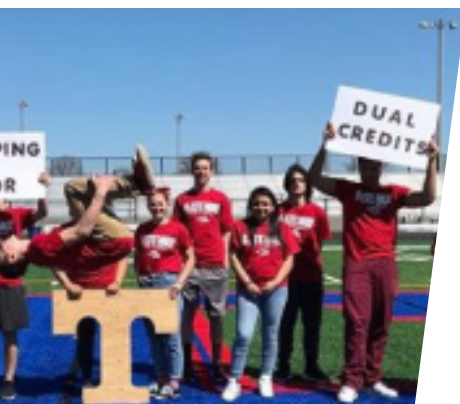
Dual Credit Day