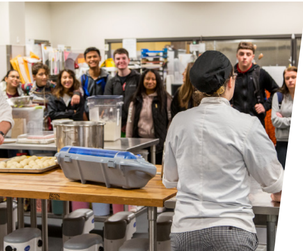
Explore Gateway Tours