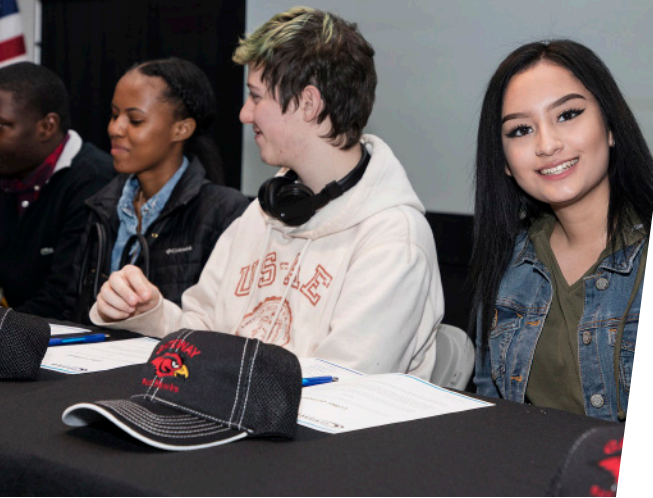
National Signing Day