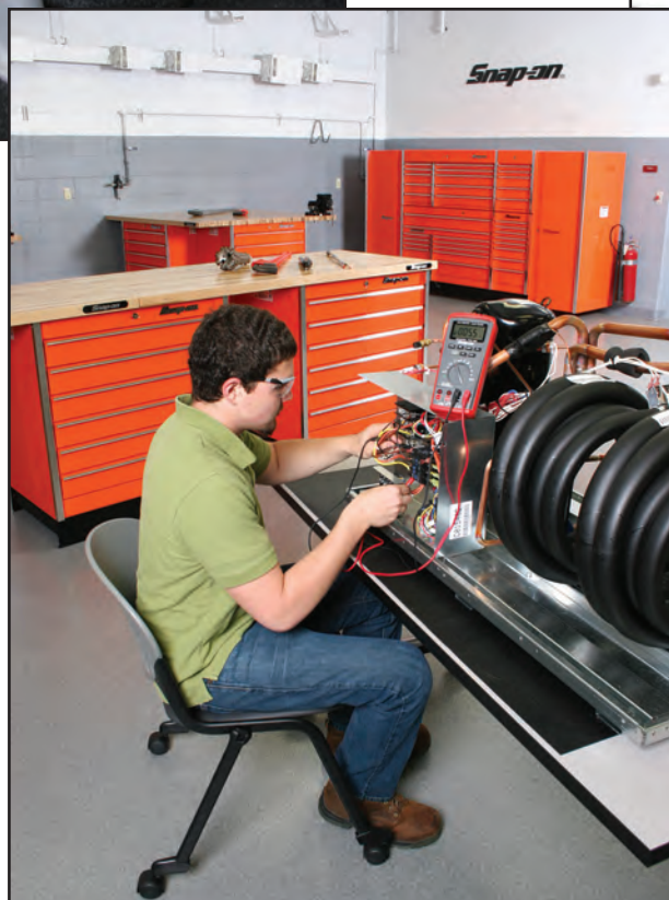
RIGHT: This is part of the geothermal lab. Students in this lab will work with the latest geexchange technologies for home and small commercial heat pump applications. They have the opportunity to gain hands-on experience from the exterior drilling/construction portion of a project, through installation and operation of the heat pumps inside the home or business. In the geexchange drilling program, students learn about drilling techniques and related geology, earth coupling, and loop field design and construction.