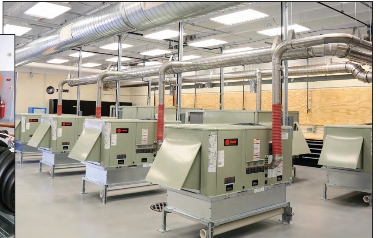
ABOVE: This is the industrial heating lab, which includes several Trane units. This lab provides the opportunity to work on the most popular types of packaged commercial/industrial heating/cooling units, featuring the latest technology such as wireless controls. Additional features include eight hydronic systems coupled with radiant floor and conventional heat emitters. The lab also has a six-panel solar thermal hot water installation that provides potable hot water and helps heat the Kenosha Campus.