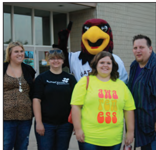
Gateway students have fun at the Drive-in Movie Night at the Kenosha Campus.

Veterans Administration refunds processed for students with last names L–Z