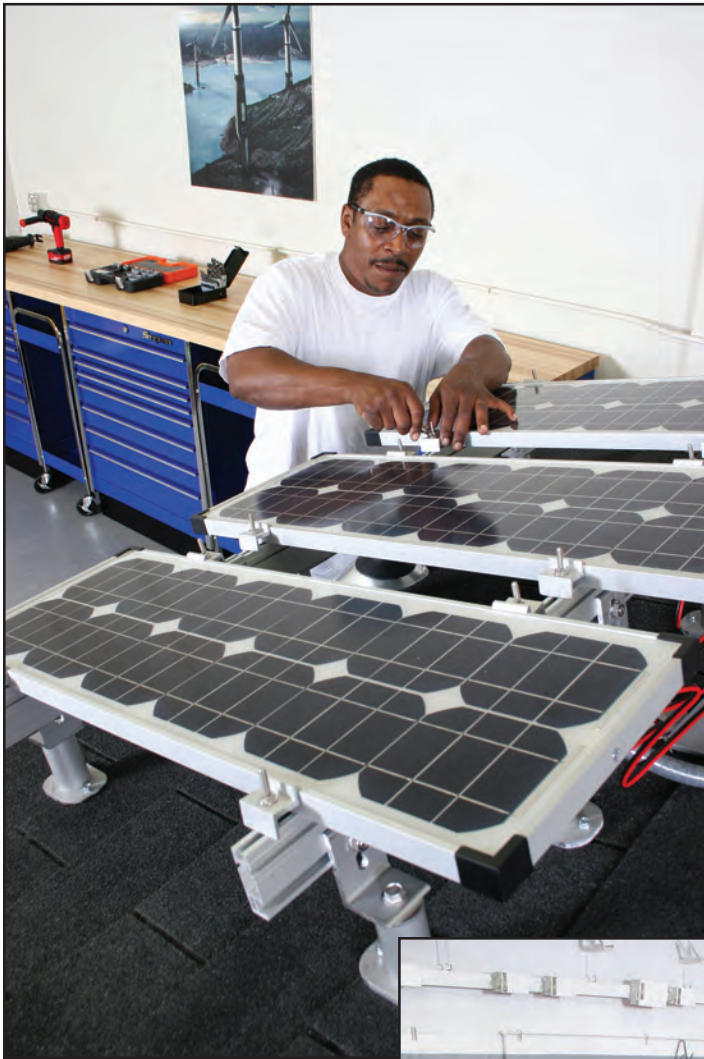
ABOVE: This is the sustainable energy lab. Students gain work-ready skills in a hands-on learning environment, using equipment trainers provided through Questech and Amatrol, in alternative energy systems. The training units contain a space-condensed, complete system from the energy generator/collector to home/business installation.

The labs are representative of each aspect of the industry: residential heating and cooling, industrial heating and cooling and sustainable/alternative energy applications.