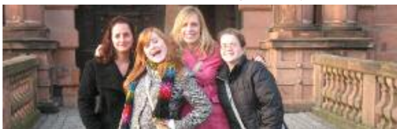
Gateway students studying in Germany.

Applications for participation in any of these experiences are due by March 30, 2012. Students can find full program descriptions and application information at gtc.edu/studyabroad .