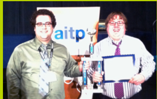
Contact: Allen Pearson