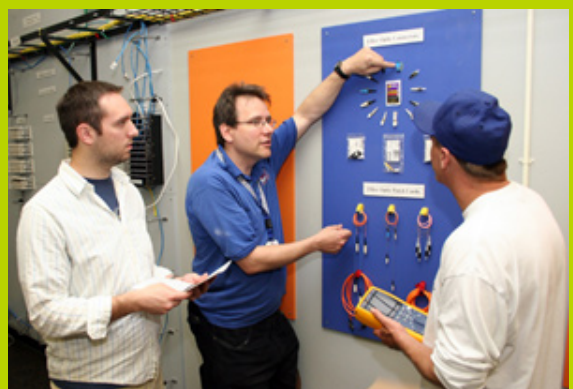
Gateway is offering a Telecom Smart Career Restart, which will help graduates seeking work in the field of telecommunications cabling. www.gtc.edu/dislocatedworker