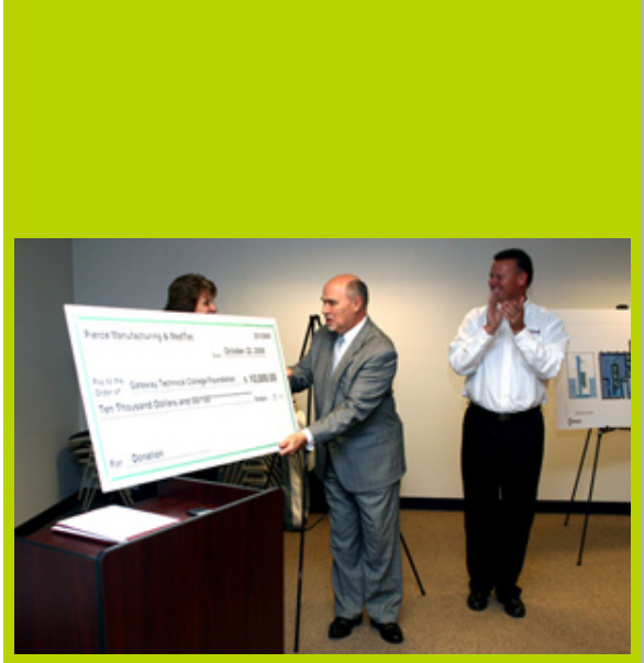
Pierce Manufacturing Inc. and Medtec Ambulance Corporation combined to establish an endowed scholarship for Gateway EMS and Fire Protection students.

The scholarship will be available to Gateway students in emergency medical services and firefighting programs. Pierce Manufacturing is the leading manufacturer of custom fire apparatus and Medtec Ambulance Corporation, a leading manufacturer of custom ambulances.