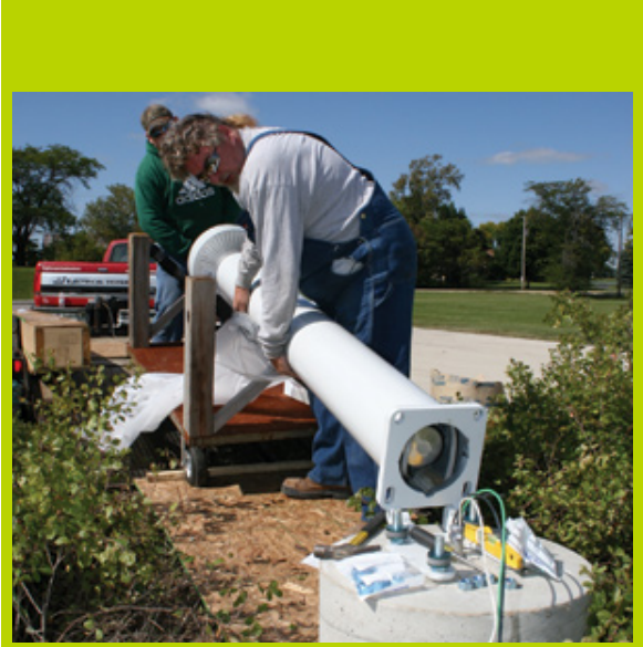
Workers begin installing a wind power appliance at Gateway's CATI center.

The new opportunities were made possible by the recent installation of a digital transmitter in Kenosha which was financed in part with a $72,000 grant from the Corporation for Public Broadcasting. The new transmitter won't affect WGTD's low-power "translator" stations in Walworth