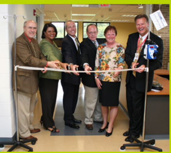
Gateway held a ribbon-cutting and open house for its new Elkhorn Campus Health Wing.

The standards are intended to be research and evidencebased, aligned with college and workforce training program expectations, reflective of rigorous content and skills and internationally benchmarked.