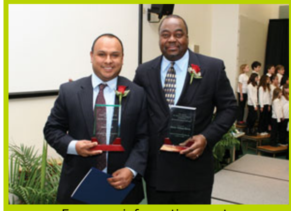
For more information, go to <a href="http://www.gtc.edu/humanitarian">http://www.gtc.edu/humanitarian</a>

As part of the initiative, Gateway has begun to train instructors, develop training labs, and recruit students to meet growing employment demands.