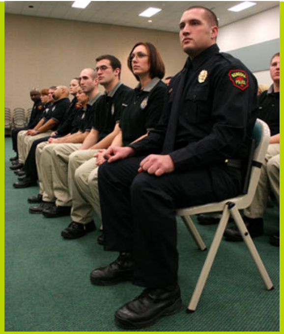
For more information, or to sign up for the September academy, go to www.gtc.edu/leacademy