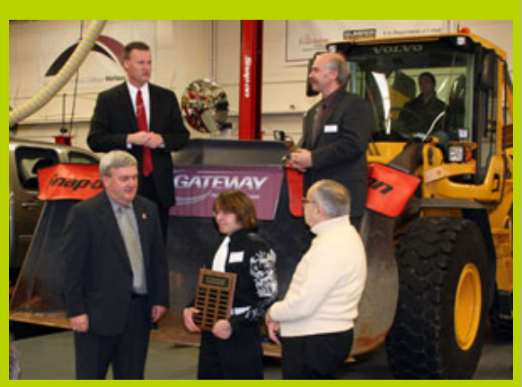
For more information, go to www.gtc.edu/foundation