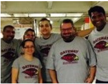
BPA Kenosha poses for a picture after a job well done!

On Saturday, November 16, 2013, members of Gateway's Business Professionals of America (BPA) Kenosha Chapter participated in the Racine Food Bank's annual Holiday Meal Box Assembly Event.