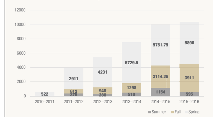
Student Hours by Semester by Year

The Service Learning Center also finds value in collecting the number of faculty, courses offered, programs implementing service learning, and the overall engagement of stakeholders. This year, we had 86 courses offering 826 students the opportunity to accumulate 10,492 hours of service at 125 community partners throughout the Gateway District and abroad.