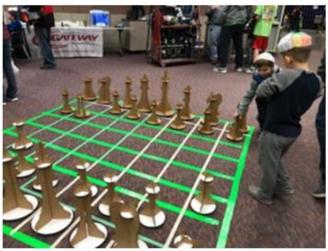
Elkhorn's Mini Maker Faire

The Fab Lab couldn't resist celebrating Pi Day in their own unique way - by laser engraving a pie with pi.