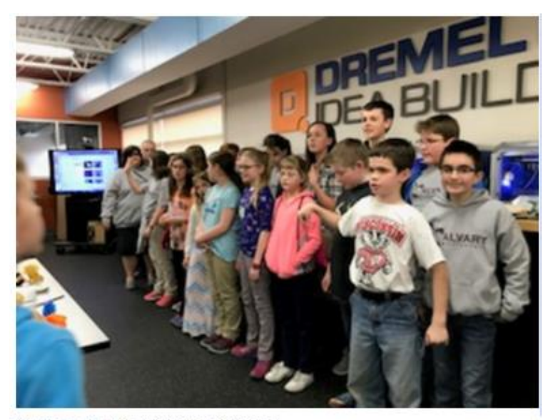
Calvary Baptist Church School