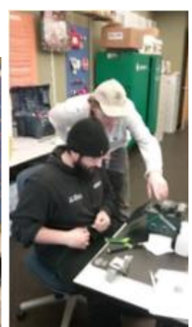
The Telecom Cable Installer Boot Camp IV just completed week 9 of the 12-week adventure. Students take eleven different classes including Lift Training and Speaking Principles.