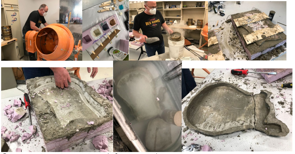
Once cast, parts must soak for a month.