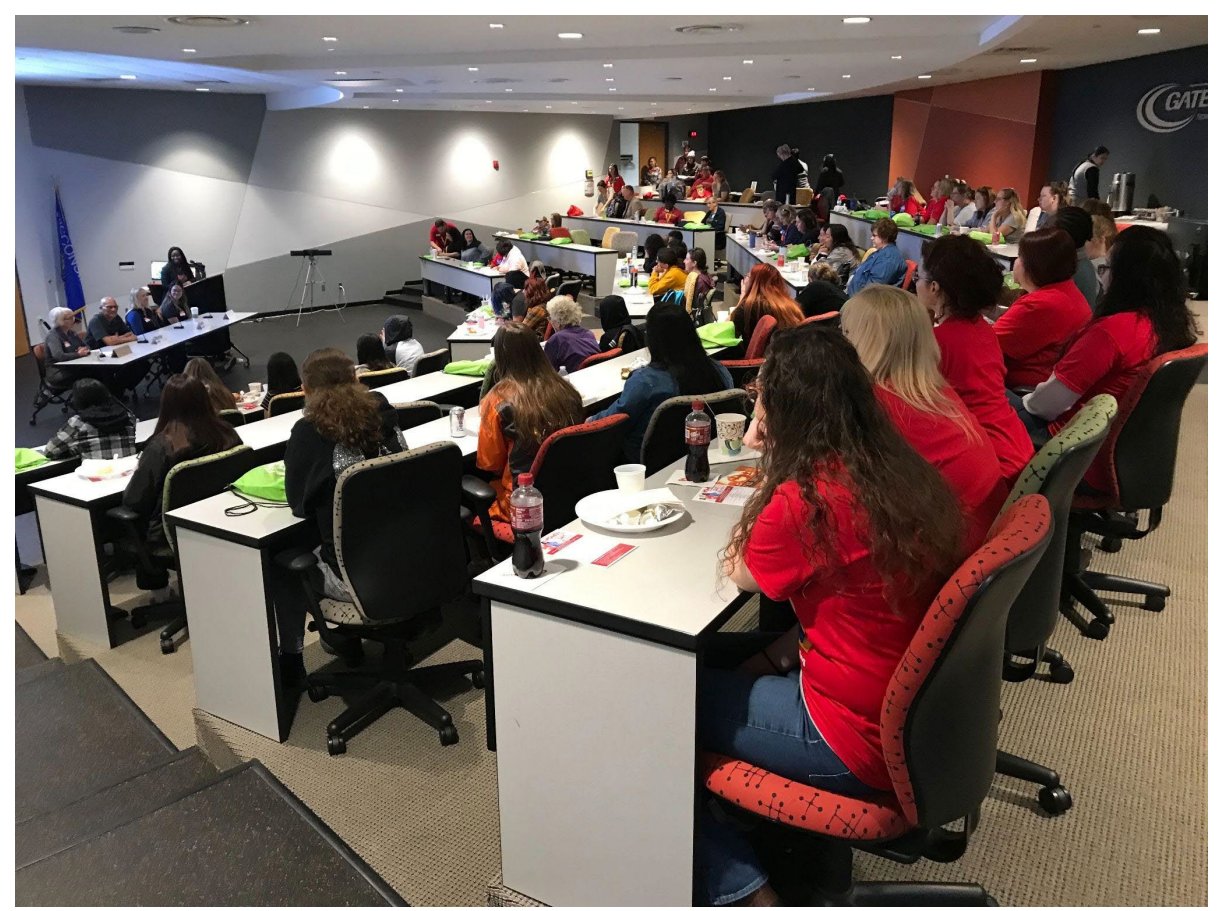
Participants were presented with an opportunity to hear from Women, and Employers about the challenges and rewards of careers for women in Manufacturing.