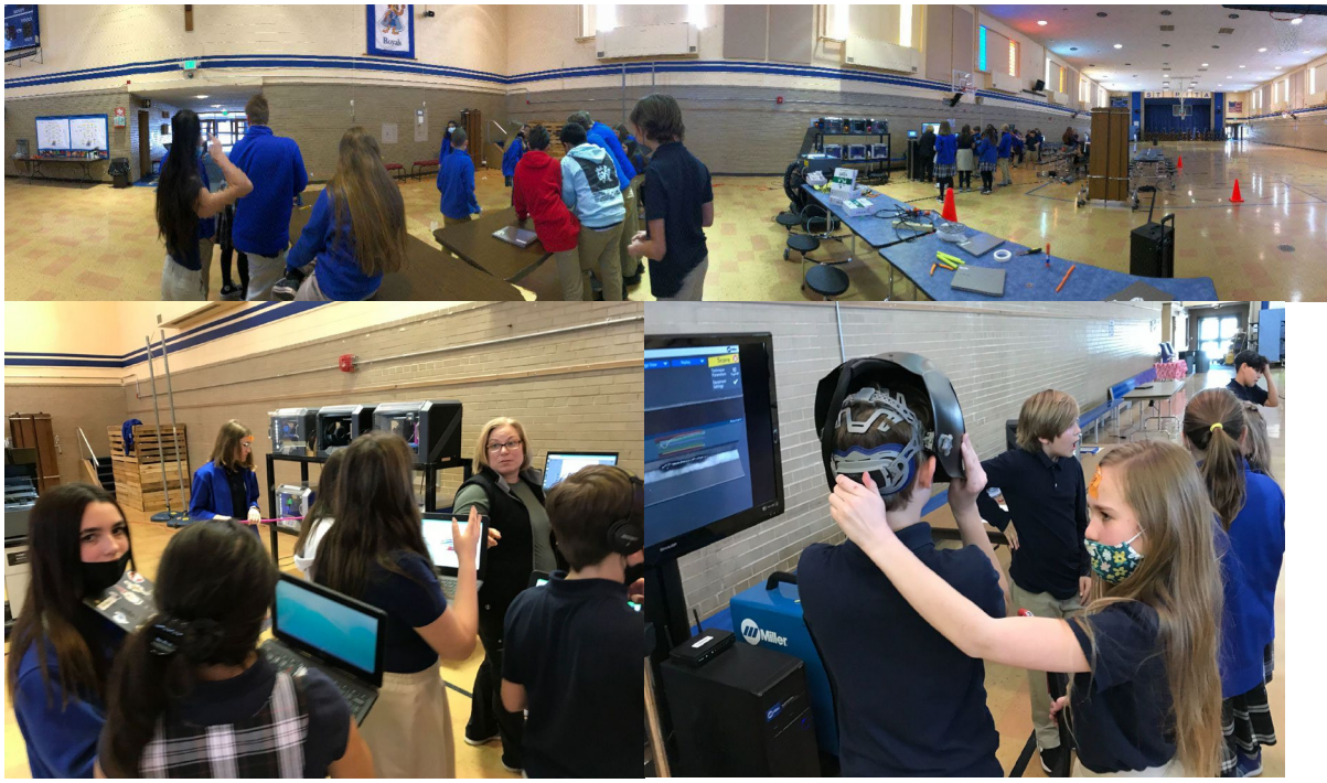
RC Cars and CNC subtractive carving workshops happened this month with RAHS Homeschool and Bridgehomeschool groups. The Lab also assisted two students with printing a rehabilitation project to help disabled kids to play the drum.