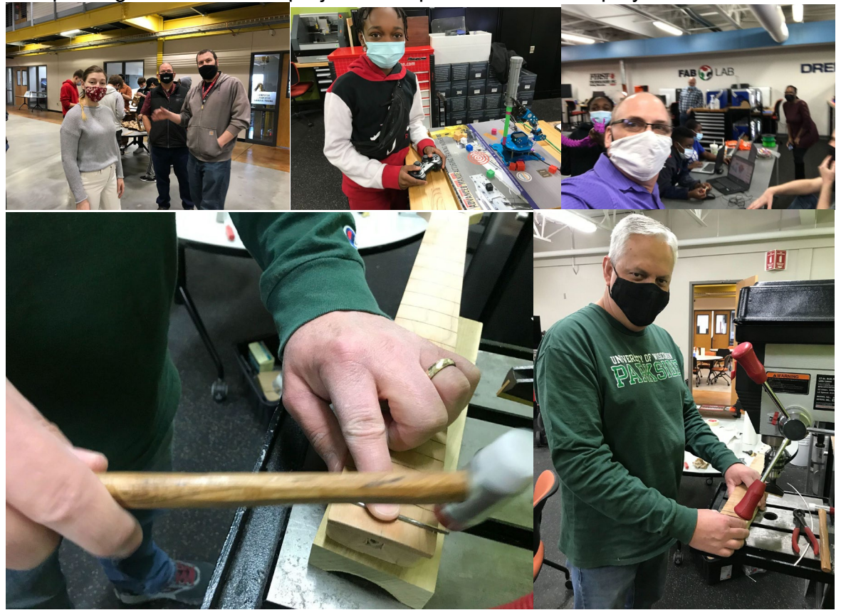
Among other activities this month, the Fab Lab continued its Guitar building sessions. Two Foundation build recipients continued building and learning about guitars, and all the digital equipment Gateway brings to the table in education. The