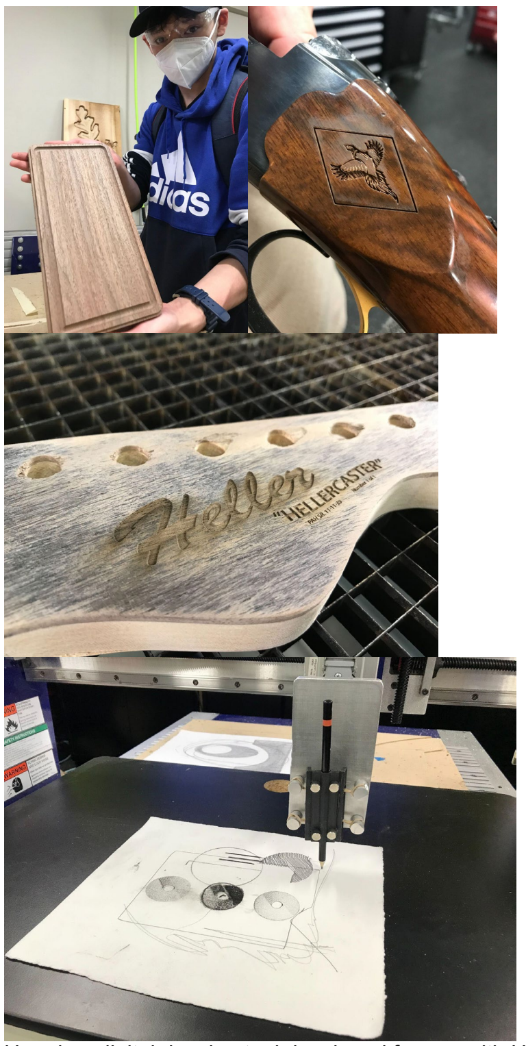
Here is a digital drawing tool developed for use with Harley Davidson's "Day of STEAM" Look forward to more on this partnership next month.