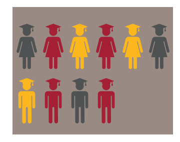
88% of graduates in the labor force are employed