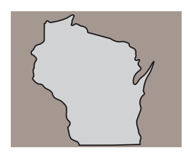
91% of our graduates work in Wisconsin