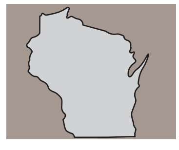
93% of our graduates