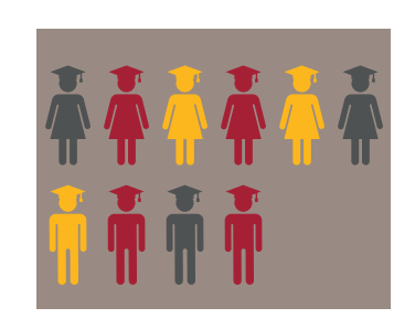
92% of graduates in the labor force are employed