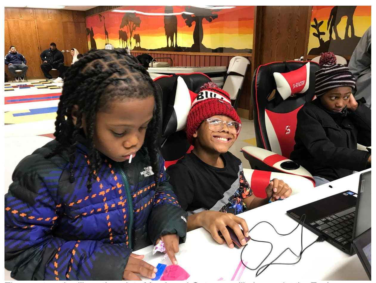
The grant work will continue into March and Gateway will also assist the Tech sessions with Esports and virtual reality.

Gateway industrial Design Fab Lab launched the premier broadcast of its new radio show, "Fab Lab 10:00 A.M." in January. The show airs on the second Saturday of the month at 10:00 A.M. on Gateway's own WGTD.