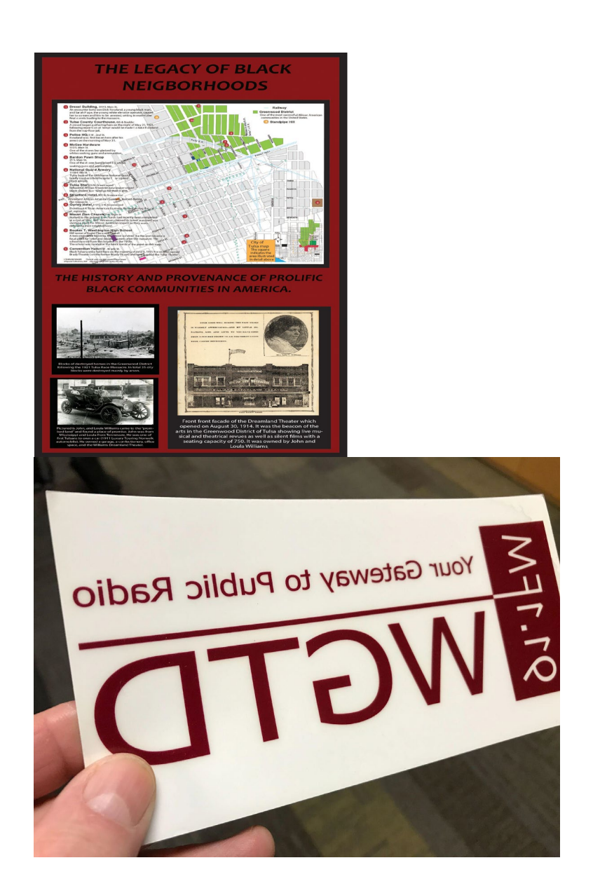
Visitors and Programs