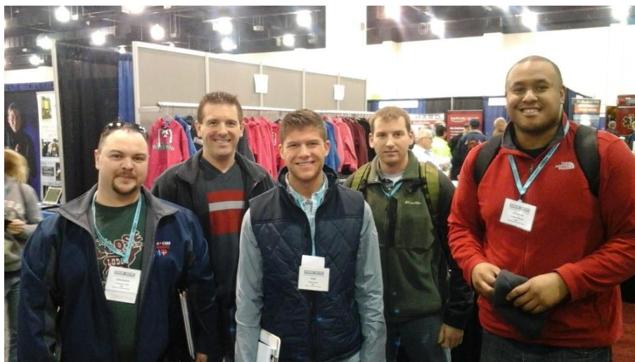
Gateway students enjoying the conference