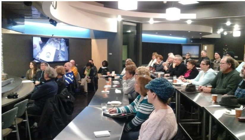
Audience for making pasta

Join us on March 27 th for the next Demonstration Kitchen Cooking event with Fein Brothers Dexter Cutlery Demonstration.