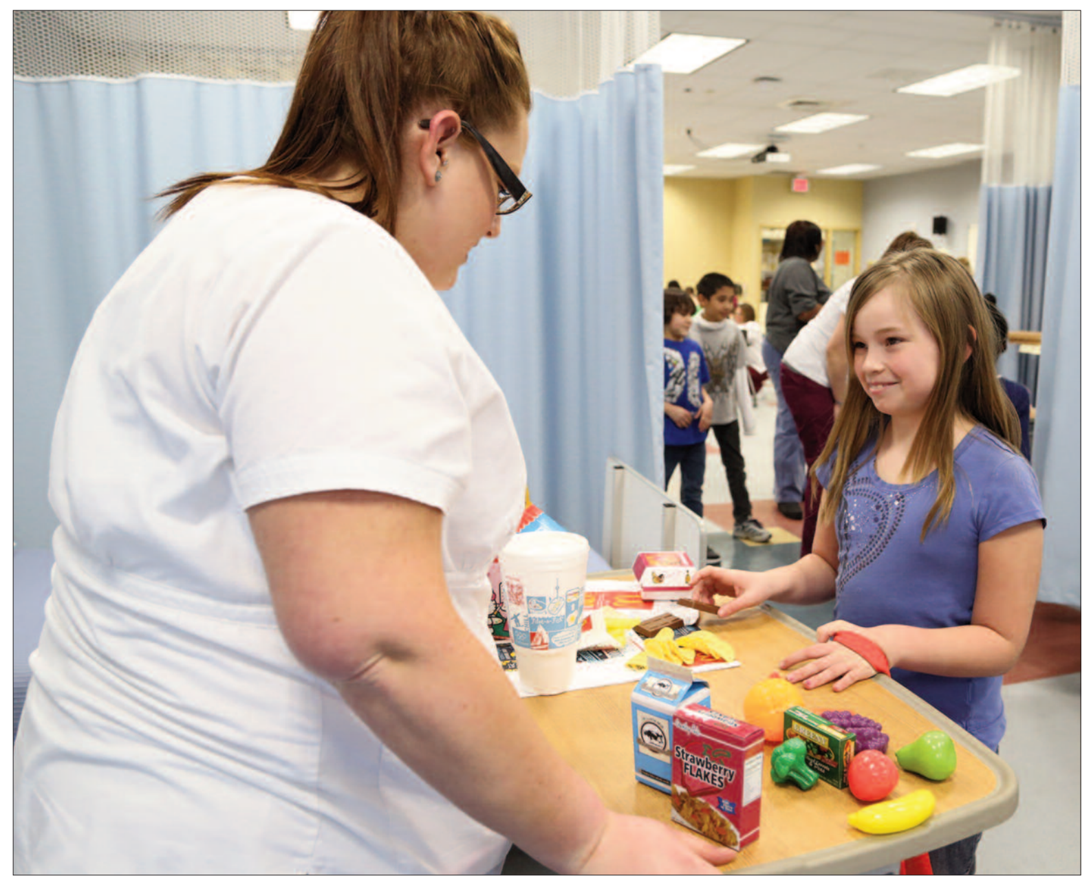
Children enjoyed learning about proper nutrition and how it relates to good oral hygiene.