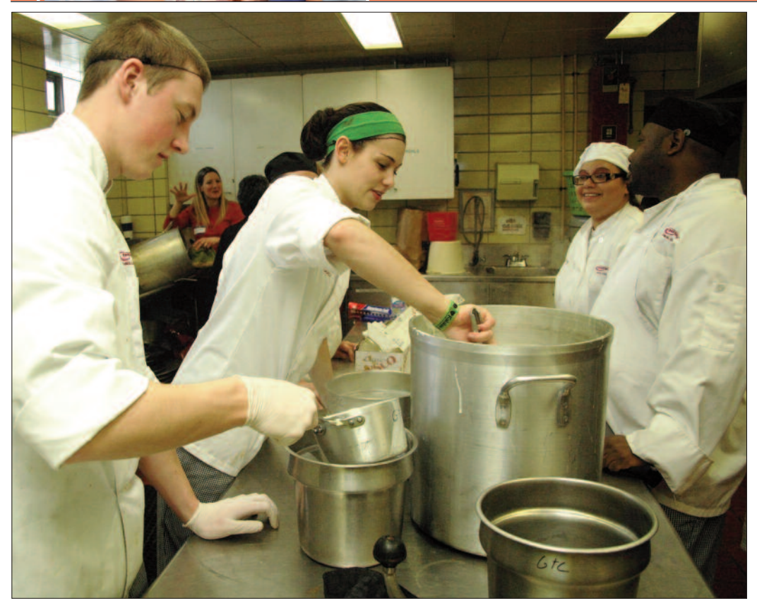
Gateway culinary students served up their skills, and tasty treats at Empty Bowls. The annual fundraising project raises awareness about hunger and homelessness in the community.

Gateway Technical College news & information April 2013