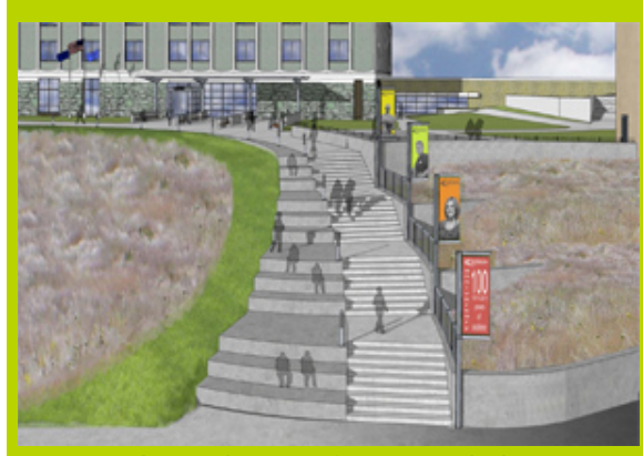
An artist's rendering of proposed changes to the Racine Campus.