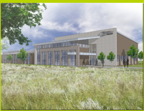
An artist's rendering of proposed changes to the Elkhorn Campus.