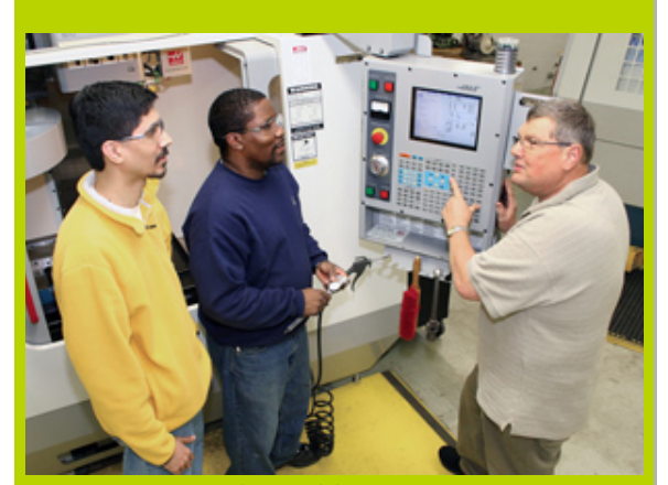
View the publication here.