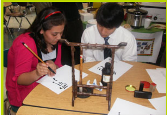
People attending the World Festival were able to learn how to write their name in Chinese.