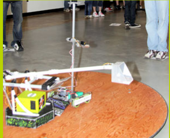
Students compete at the SumoBot competition hosted by Gateway recently. For more information, hoppep@gtc.edu