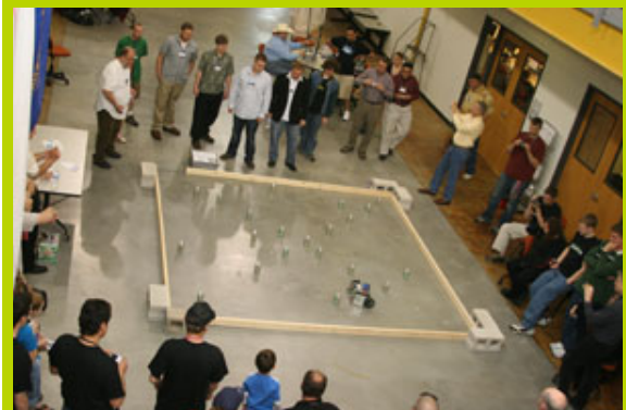
Technical college students compete at a statewide robotics competition hosted at Gateway.