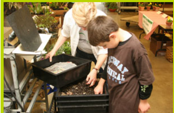
There were many hands-on activities for adults and children at Celebrate Earth Day hosted by Gateway www.gtc.edu/earthday