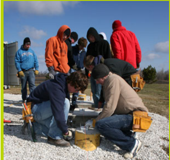
Students and community partners help work on a roof vent prop training deck.

This is the third year Gateway has hosted the event. Teams competed were from: Gateway Technical College; Waukesha County Technical College; College; Northwest