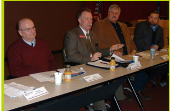
State lawmakers talk at a recent legislative breakfast.

The boot camp will help dislocated and underemployed workers by putting them through a rigorous, 19-week program beginning March 26. It trains them in the