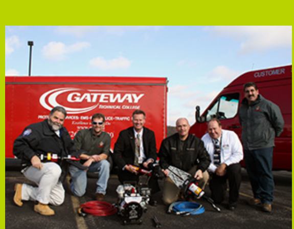
Extrication equipment was recently donated to Gateway which will aid training. www.gtc.edu/ems

The program is designed to respect the time of busy personnel with a combination of flexible online learning, limited classroom training, and personalized one-on-one coaching. Learners study behaviors of successful leaders, compare those behaviors to their own, and are then given the tools to bridge any gaps.