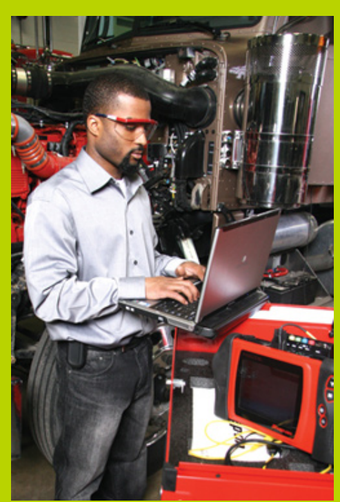
For more information, www.gtc.edu/horizoncenter

Much of the training focused on advanced automotive technologies as well as best practices on how teachers can create curriculum and deliver instruction to their students on these technologies. Training sessions for the four-day seminar included such topics as Snap-on diagnostic equipment, Subaru braking systems, Lexus Hybrid diagnostics, Wisconsin Vehicle Emission Inspection Program