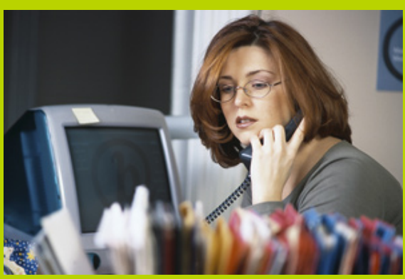
For more information, www.gtc.edu/dislocatedworker