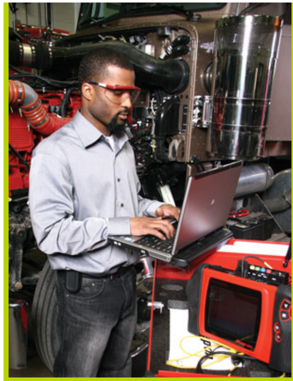
For more information on the diesel program, go to www.gtc.edu and click on Career Options, or visit www.gtc.edu/horizoncenter