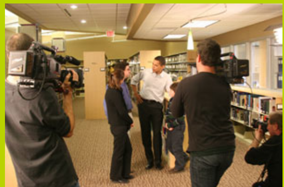
Democratic presidential candidate Sen. Barack Obama shoots some footage at the Racine Campus learning resource center during a campaign swing through Southeastern Wisconsin the week prior to the state's primary election. Obama visited Gateway's Racine Campus following a town hall meeting at nearby Memorial Hall.