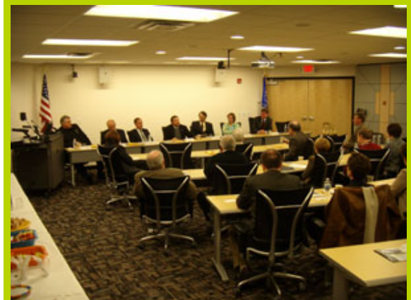
Area lawmakers attended a legislative breakfast hosted by Gateway Technical College in late February, talking about many topics including the college's role to train workers and remaining flexible in the way it offers that training. Legislators pictured, from