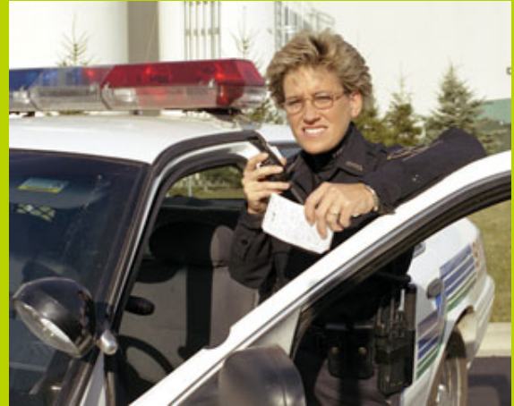
Gateway Technical College opened its first-ever police academy, which will benefit students, local employers, and taxpayers within the college district.