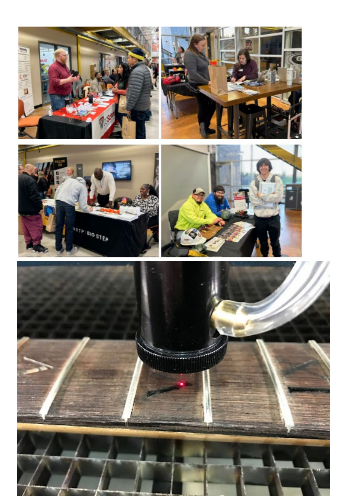
See Your Future Expo

Gateway Industrial Design Fab Lab assisted CNC with the "See Your Future" expoheld at University of Wisconsin Parkside's fieldhouse. Alongside Esports, Welding and three Nursing program booths, Gateway presented amazing career opportunities and possibilities to 1006 High School students! Students learned a bit about CNC and how the Lab uses guitar building to teach it.