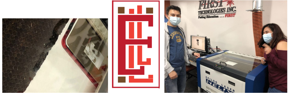
The Fab Lab hosted two sessions with English Language Learners program. Guests embroidered the "ELL" logo on masks, and did various projects while learning about Gateway's Fab Lab.

The Fab Lab had a chance to assist Westosha Students in an entrepreneurial challenge, by cutting their design in heat press vinyl. These future Red Hawks have worked diligently to produce t-shirts. This group took first place in the challenge with the highest earnings!