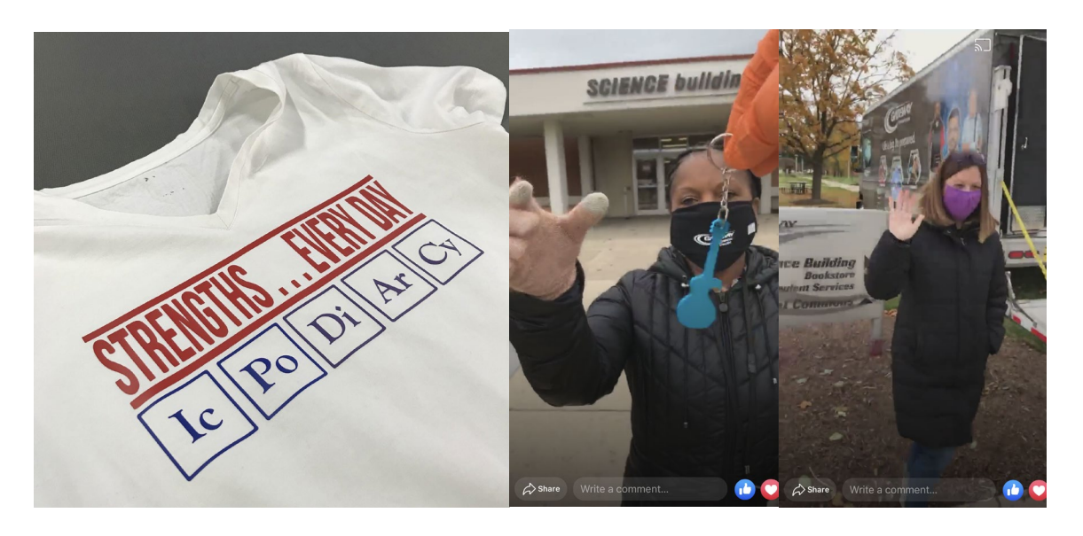
The Fab Lab has been active with additional projects, including trophies, phone holders, awards, t-shirt heat transfers, and assisting with the Metallica Scholars Food Drive.