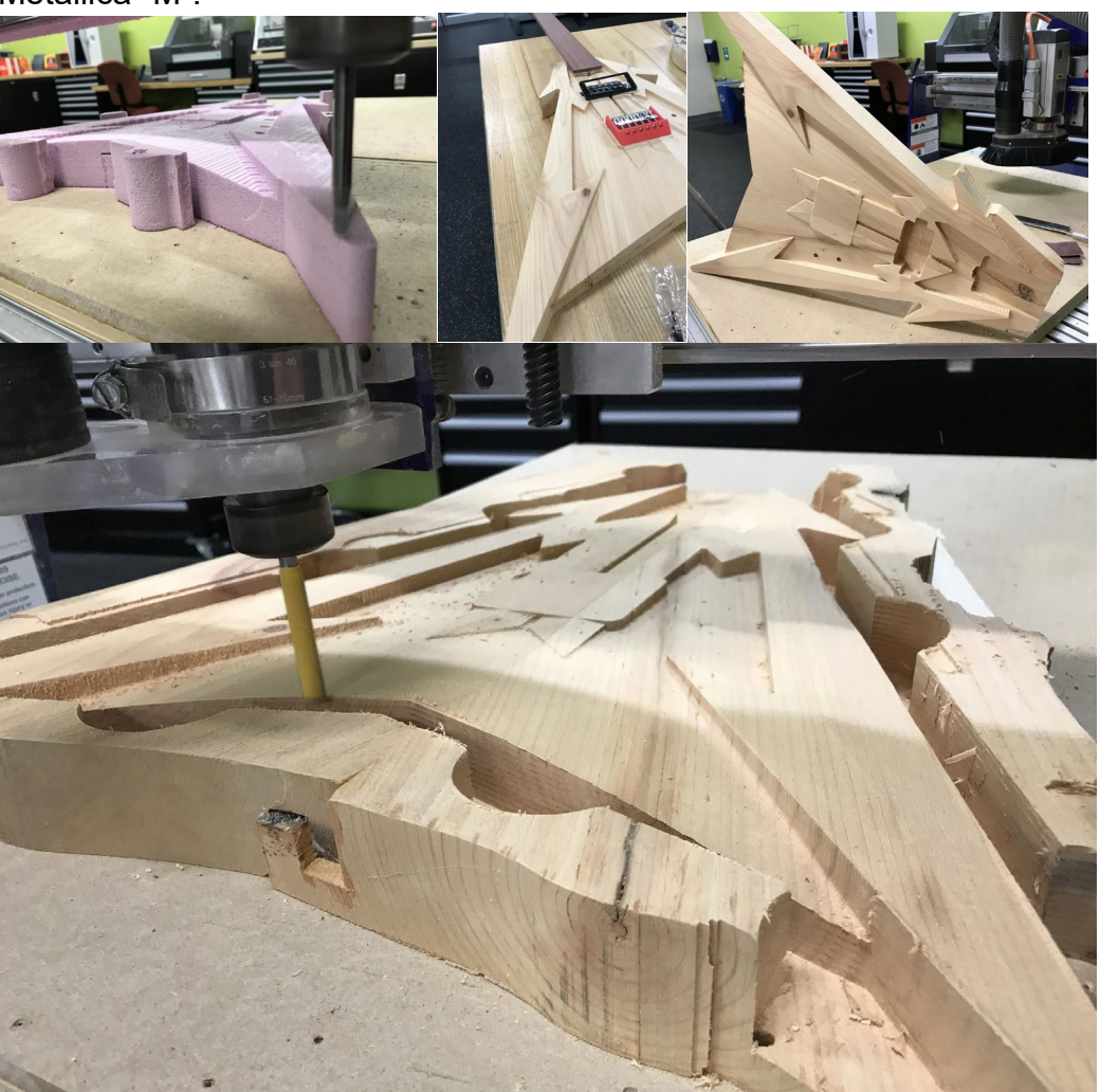
Students hope to have it completed for presentation at their November 17th Completion Celebration.

The Metallica Scholars submitted their guitar design to commemorate their class, prototype and production started this month, which modified a classic flying "V", to a Metallica "M".