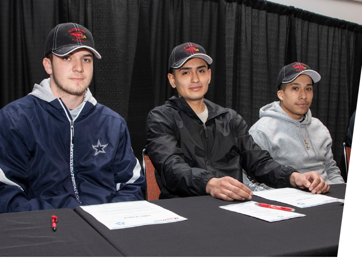
National Signing Day